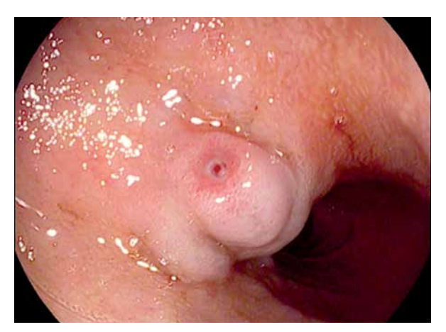
Figure 2. Upper endoscopic view of ectopic varices seen at the level of the bulb of the duodenum, showing white nipple sign

Endoscopic treatment for ectopic varices requires a certain level of endoscopic experience because they are usually located in difficult sites of the gastrointestinal tract [27, 28]. In our study, we did not identify any patient with ectopic varices in more than one location (mixed sites).